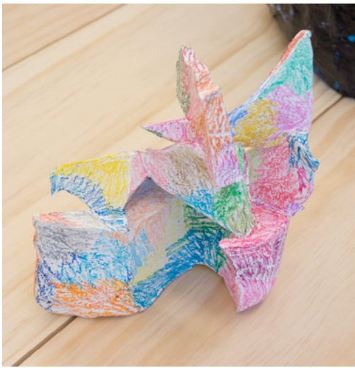
Paul Wackers, "Scribbles" (2017), crayon, fired ceramic, 8 x 7 x 4 inches

epic American landscape. When I finally got to California, I thought, "Okay, this is real."