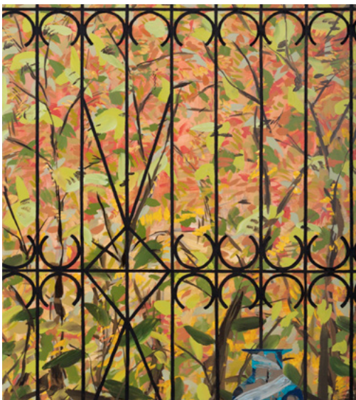
Paul Wackers, “Personal Best” (2017), oil, acrylic on canvas, 48 x 40 inches

JS: Can you talk more about the metal window grilles that are in these paintings, and your interest in the grid?