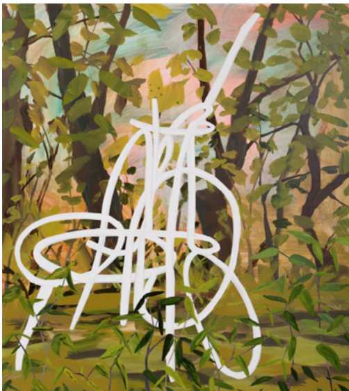
Paul Wackers, "Make Monuments of Peace" (2017), oil, acrylic on canvas, 60 x 50 inches

PW: Everything had felt very tidy before, even though there was a lot of chance involved in the process. With these paintings, I am letting go of control and allowing the process to be looser, technically. I don't do as much masking. There aren't as many painting tricks.