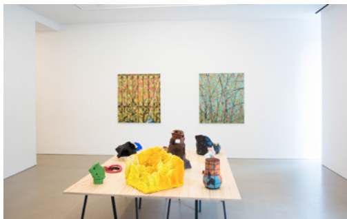
Installation view of "Paul Wackers: Early Settlers" (2017), Morgan Lehman, New York

PW: Yes, there are human-scaled things in the paintings. They could be fantastic, but they are still shown in a humble way. So in that sense, they are definitely domestic paintings.